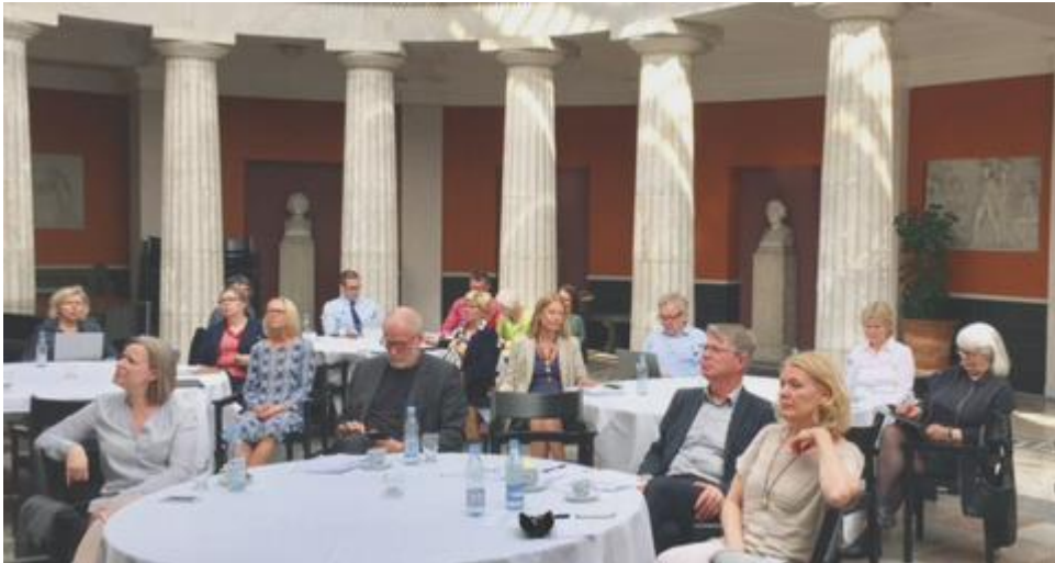
Directors' meeting participants at Carlsberg Academy

The meeting “ The Challenging Future of Nordic Universities—The Role of the University Director ” was held May 10–11, 2016 for the directors of NUAS member institutions at Carlsberg Academy in Copenhagen and was well attended (40 participants including presenters).