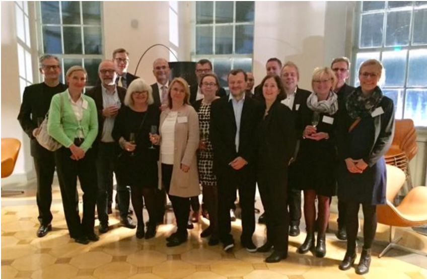
Board of Directors meeting in Åbo, October 2016.

University of Oslo took over the Chair of the Board and Office of the General Secretary for NUAS from KTH Royal Institute of Technology on January 1, 2014.