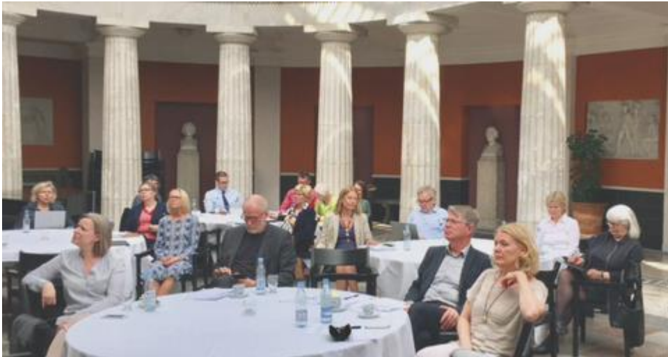
Directors' meeting participants at Carlsberg Academy

The meeting “ The Challenging Future of Nordic Universities—The Role of the University Director ” was held May 10–11, 2016 for the directors of NUAS member institutions at Carlsberg Academy in Copenhagen and was well attended (40 participants including presenters).